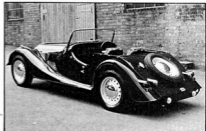
Morgan 4/4 2 seater Ford power, excellent performance

The cars are still built in carefully limited quantities by the Malvern craftsmen. A wood frame and the sliding pillar front suspension are legends in themselves, but what probably keeps the insatiable demand so constant is that the cars are very fairly priced for the performance they deliver and their excellent resale values.